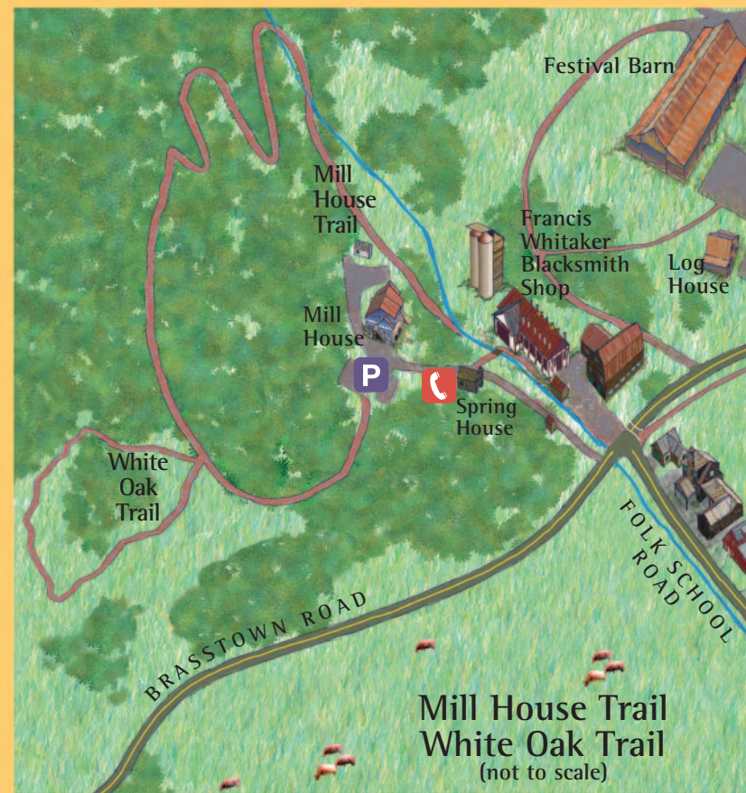
Mill House Trail White Oak Trail (not to scale)

John C. Campbell Folk School One Folk School Road, Brasstown, NC 28902 www.folkschool.org • 1.800.FOLK.SCH