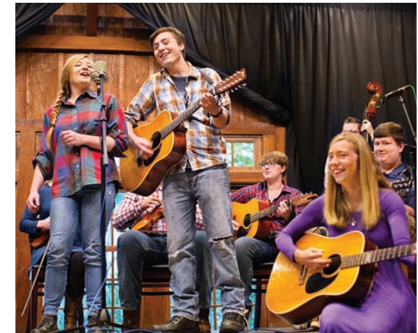
Junior Appalachian Musicians performing in the Community Room