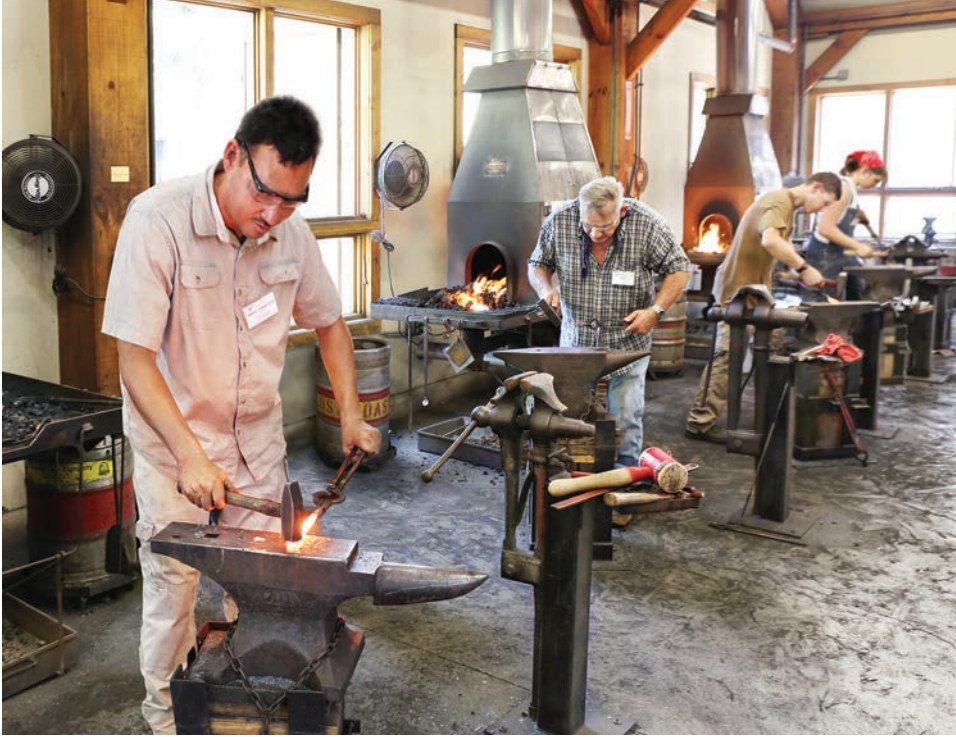
Blacksmithing students forging