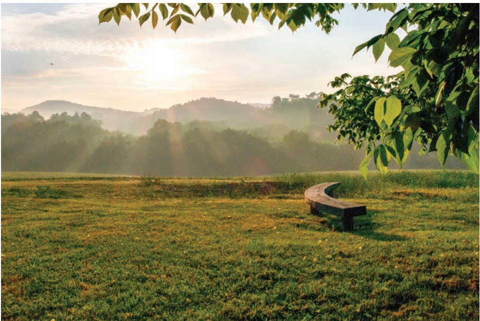
Spinning for art yarn. Painting a bird in flight. Another beautiful day at the Folk School.