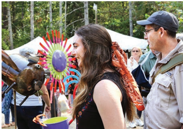
Fall Festival goers enjoy shopping