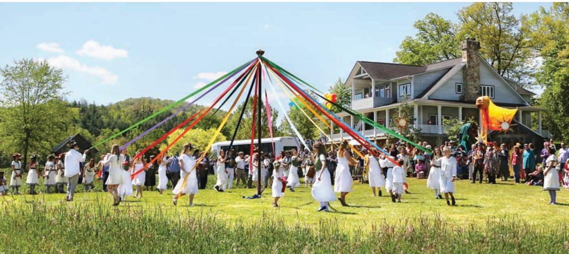
Joyous dancing around the Maypole