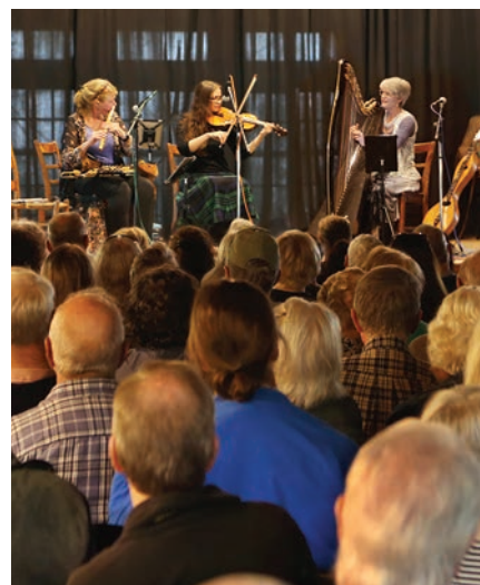
Community members fill the seats for our weekly concerts