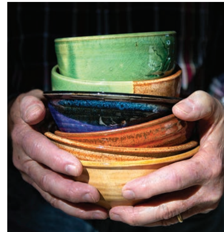
Beautiful bowls contributed by potters to our Empty Bowls fundraiser for local food banks