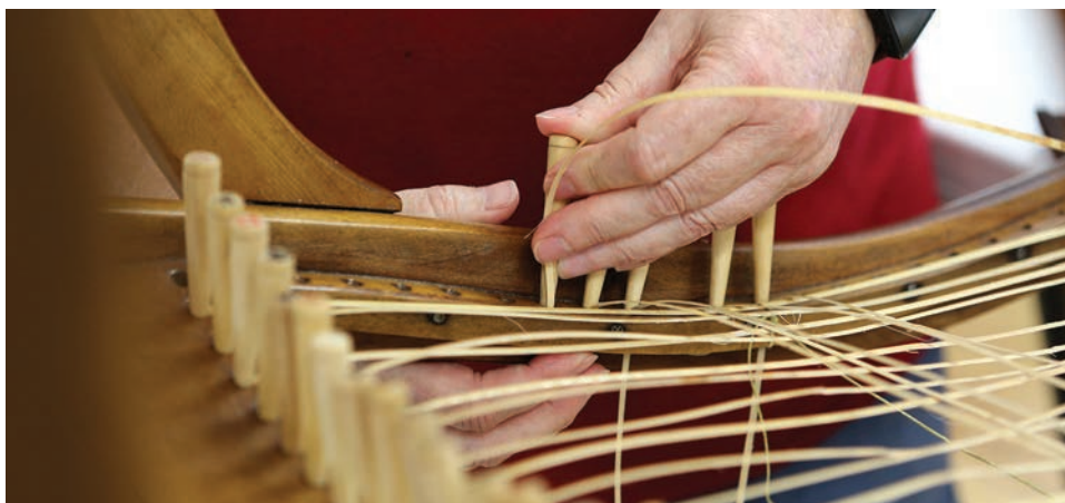
Recaning a treasured chair