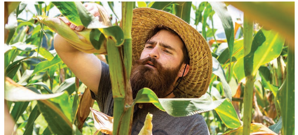
Carving a wooden spirit stick. Weaving student throws the shuttle. A Work-Study student harvesting corn