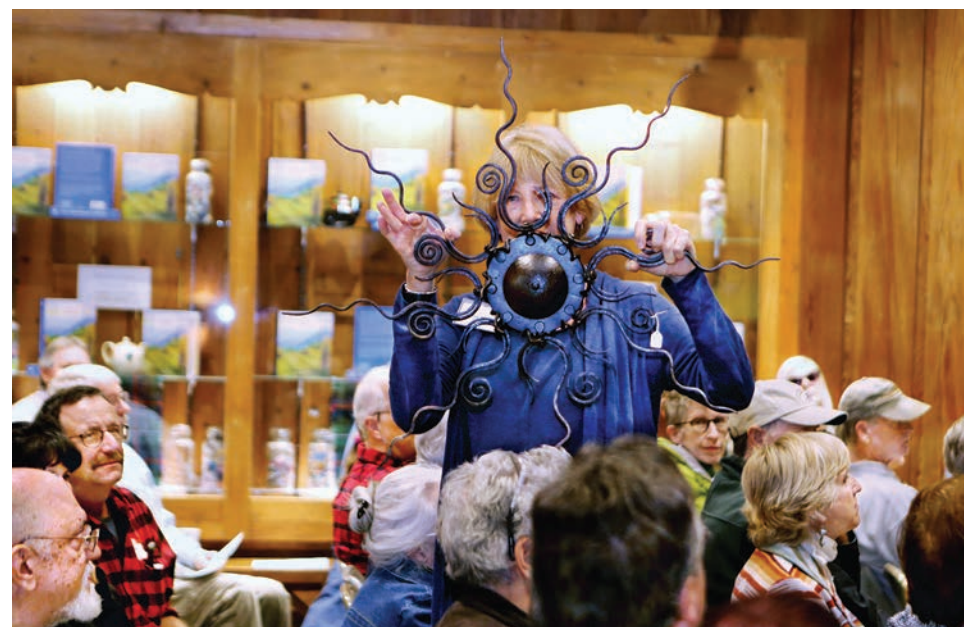
Showing off handmade craft at the Blacksmith & Fine Craft Auction