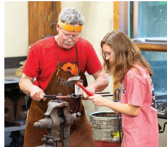
Friends and Family Day offered hands-on learning