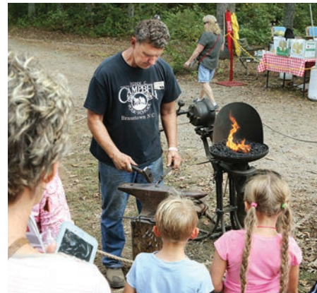
Live demonstrations at Fall Festival