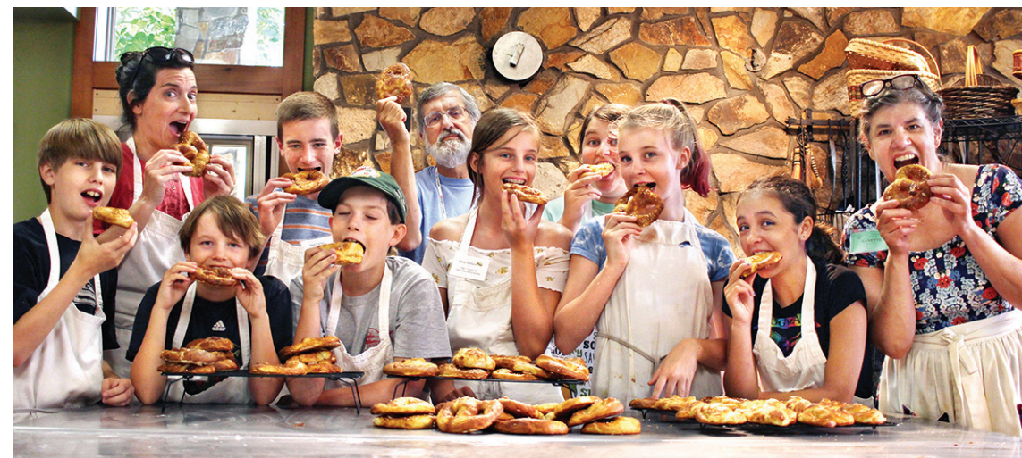
Little-Middle Folk School cooking class celebrating their tasty pretzels