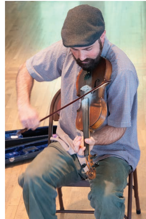
Fiddling in a music class. Glazing a clay project.