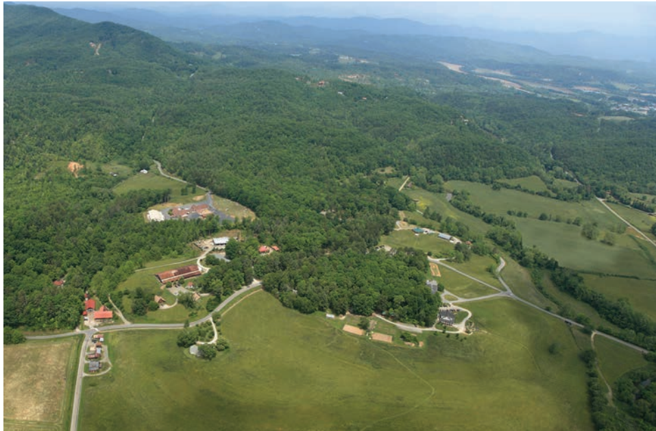
Aerial view of the Folk School, campus in foreground.