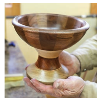
Wallace's turned bowl

a generous donation in 2017, they offered with it their belief in the school's future.