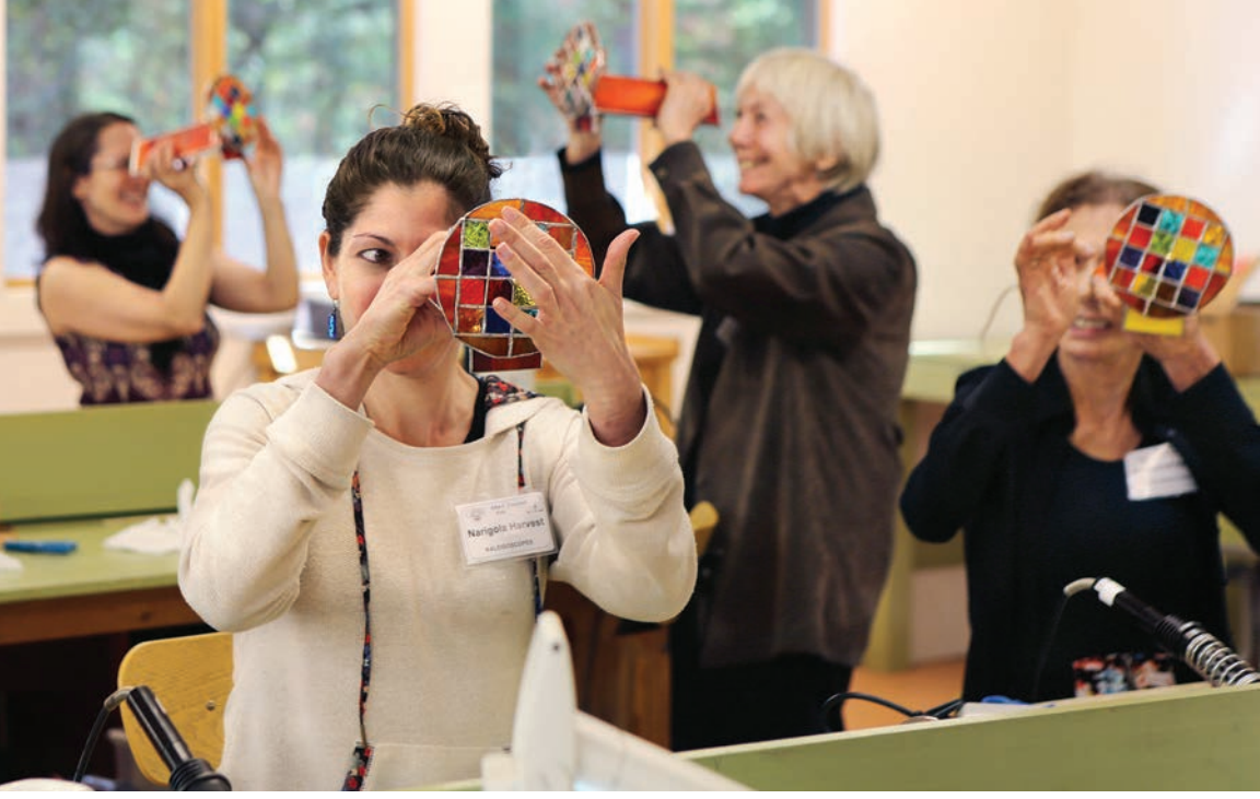
Enjoying newly created kaleidoscopes